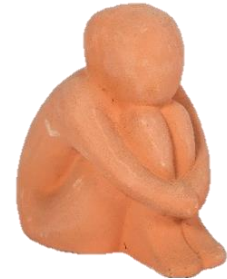
RELAXING MAN F091 D: 14 W: 10 H: 22