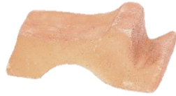
POT FEET SMART