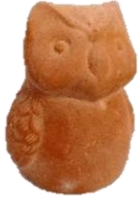
OWL SMALL OWLSML D: 11 H: 15