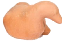
DUCK T/C SINGLE 8810 D: 28 H: 18