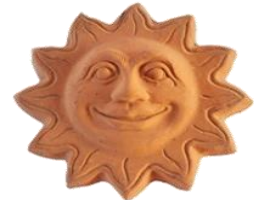
SUNFACE SMALL 8826 D: 22 H: 6