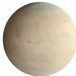
BD BALL BD032 D: 30x30