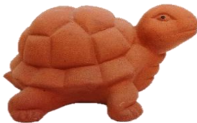
TURTLE t/c 8036-M D: 20 W: 16 H: 10