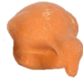
DUCK T/C SINGLE 8810 D: 28 H: 18