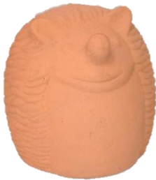
HEDGEHOG TC HHOG D: 20 H: 21